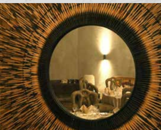
TABLE OF FACTS